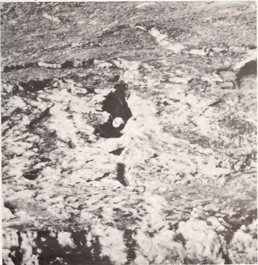
Fig. 21. Horned puffin on its nest in a crack on a cliff; Cape Peirce, 25 July 1976.

Horned puffins nested in the coastal portion of the study area in rock crevices in cliffs (Fig. 21) and in boulder piles along the shore above the high tide line. Sowls et al. (1978) estimated more than 4,000 birds in the study area, all on rocky shores and islands south of Chagvan Bay. In